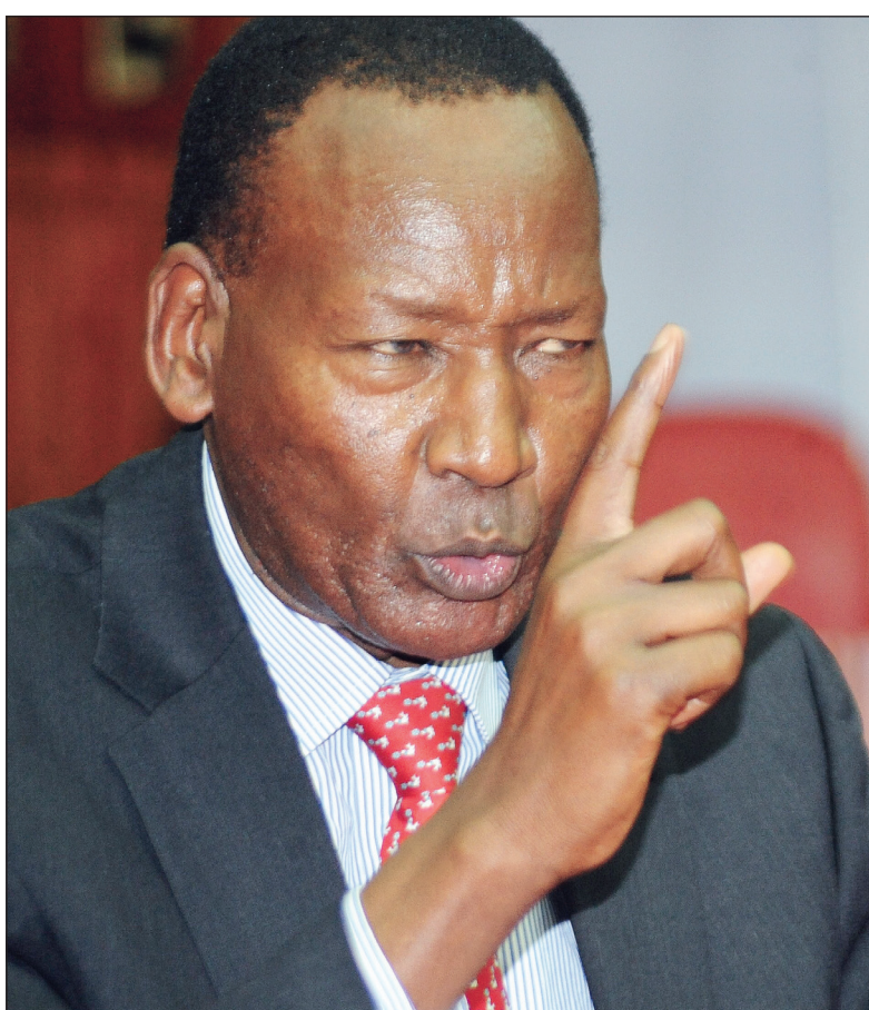
Joseph Nkaissery is set to replace Joseph ole Lenku as Interiror Cabinet Secretary following the approval of his nomination by the National Assembly during a special session yesterday.

The House then called the mover of the motion twice before approving Joseph Nkaissery to head the Interior ministry.