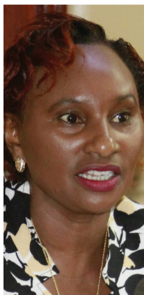
Ombudsman Florence Kajuju.

"In fact, these acts constitute express violation of the Constitution, the Anti-Corruption and Economic Crimes Act, the Leadership and Integrity Act and the Leadership and Integrity Code for CAJ